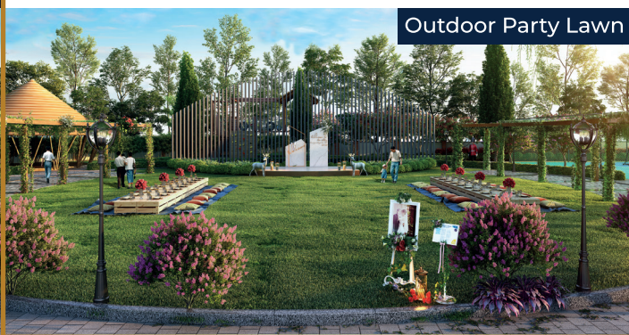
Outdoor Party Lawn