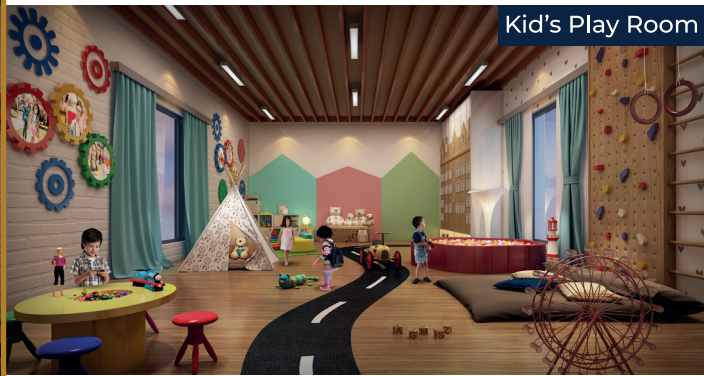
Kid's Play Room