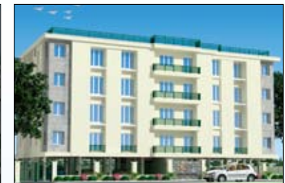
CASA GRANDE WHITE OAK