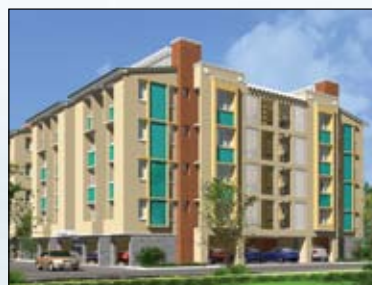
CASA GRANDE RIVIERA