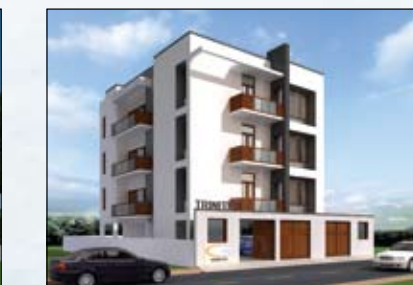
CASA GRANDE TRINITY