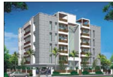
CASA GRANDE ARCOALEÑO