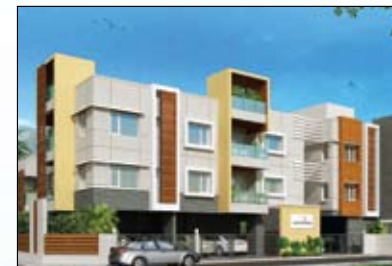
CASA GRANDE CORAL REEF