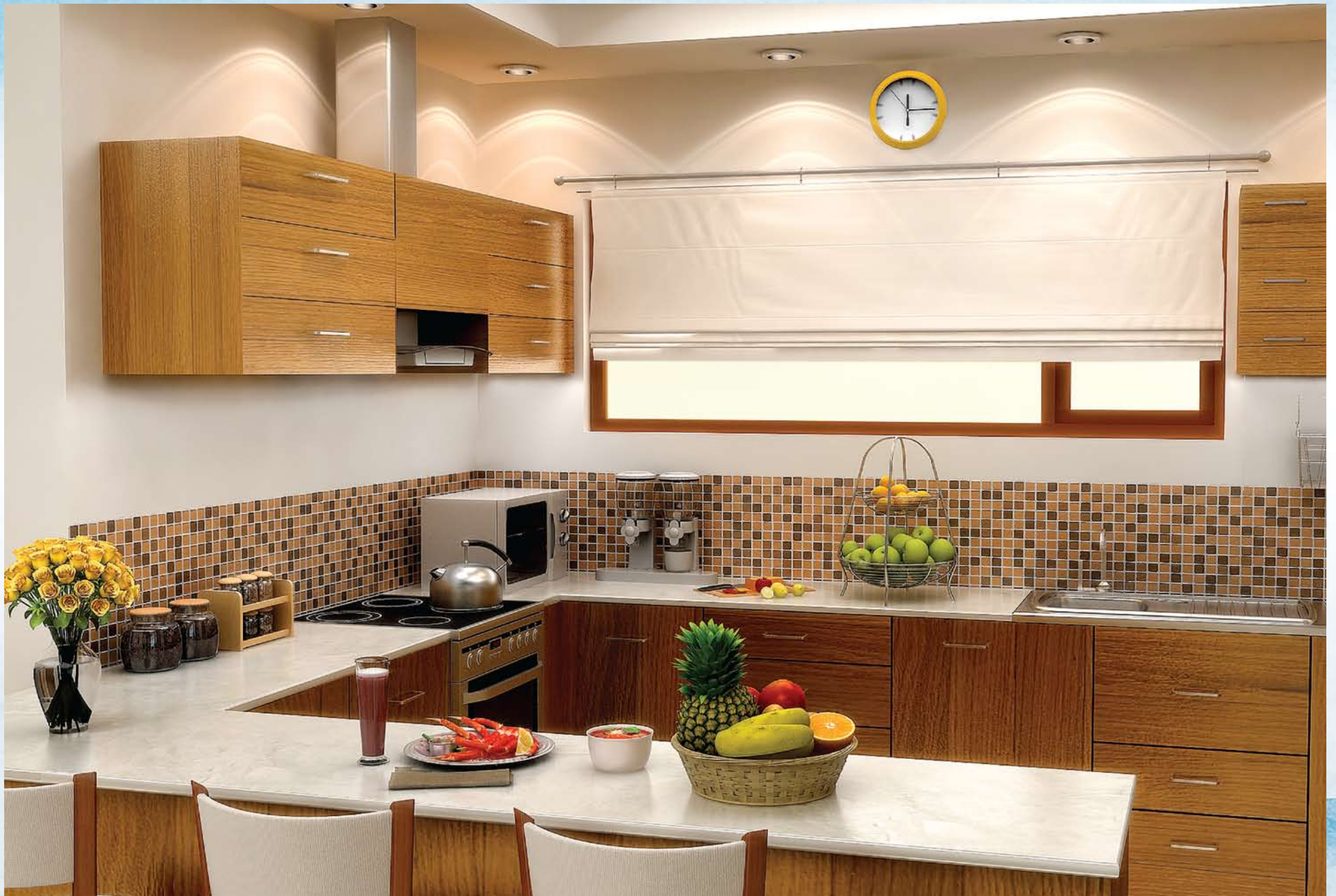
Embark on an exotic culinary journey in this large and sunny kitchen.