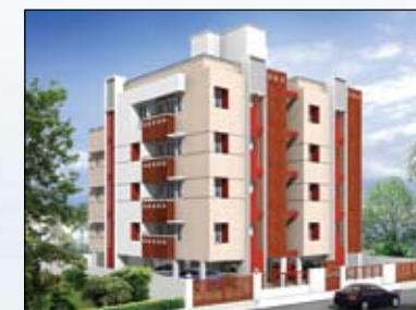
CASA GRANDE MADHUBAN