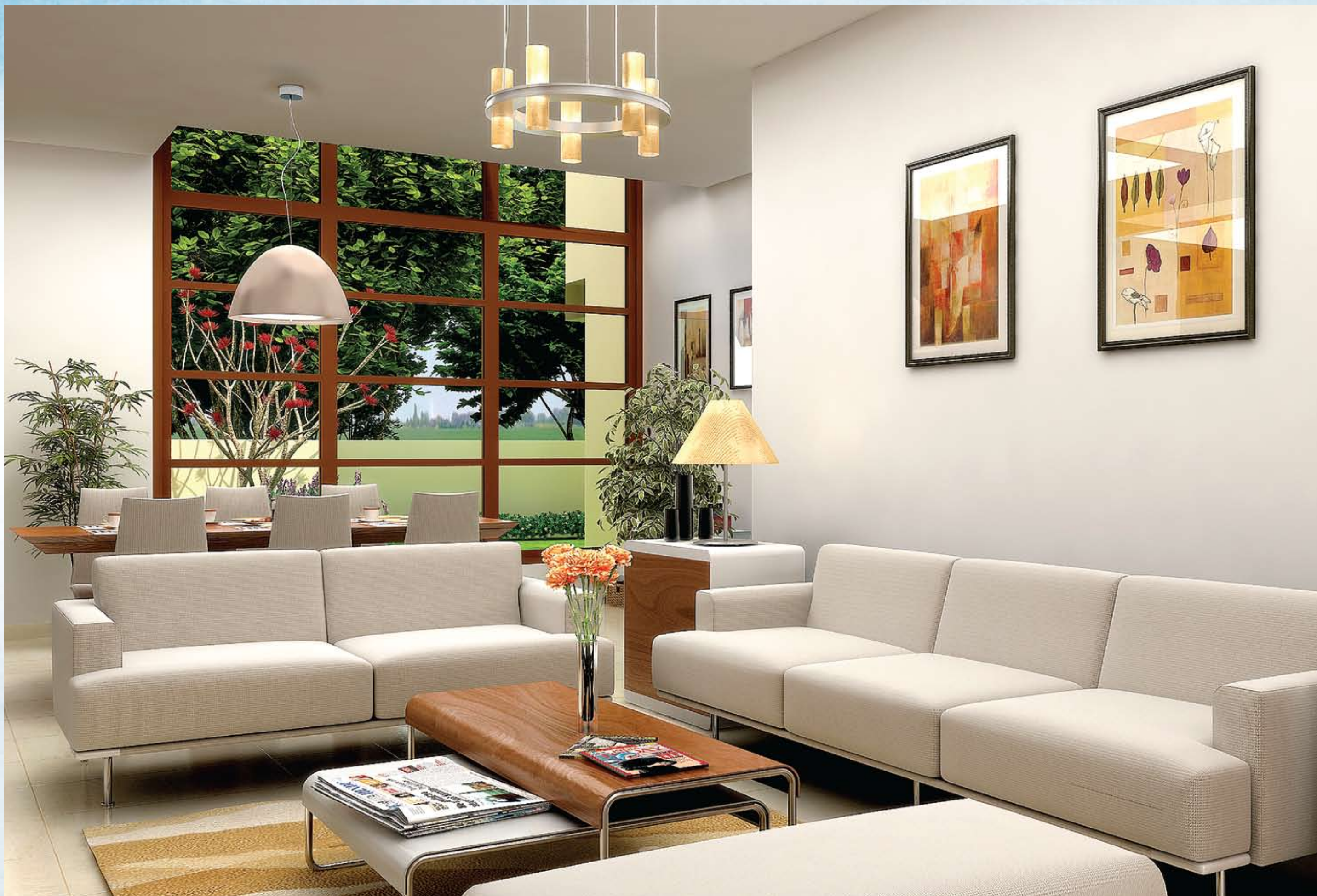
An understated elegance in the design of the living room redefines luxury for you.