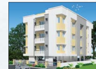
CASA GRANDE LAKSHMI