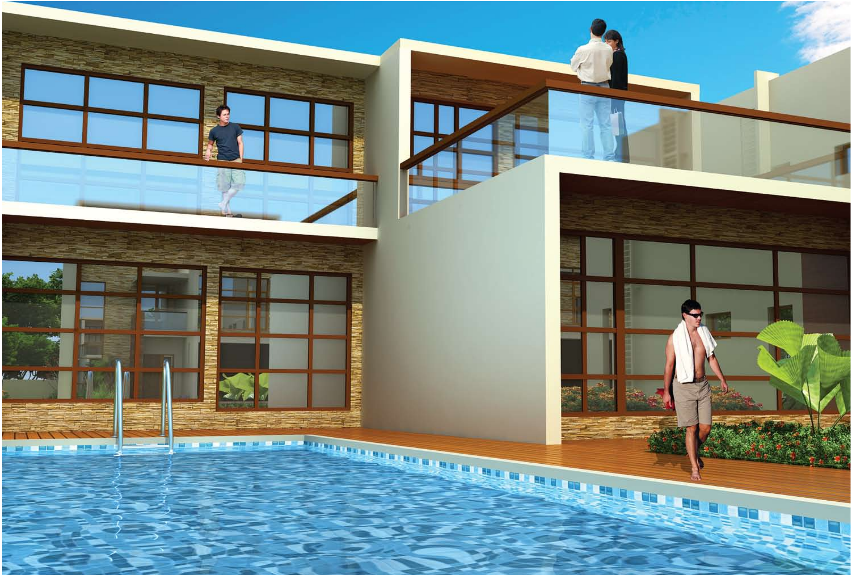
Take a cool dip in the pool or relax with your friends in the swank club house.