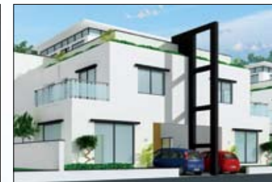
CASA GRANDE AUBURN