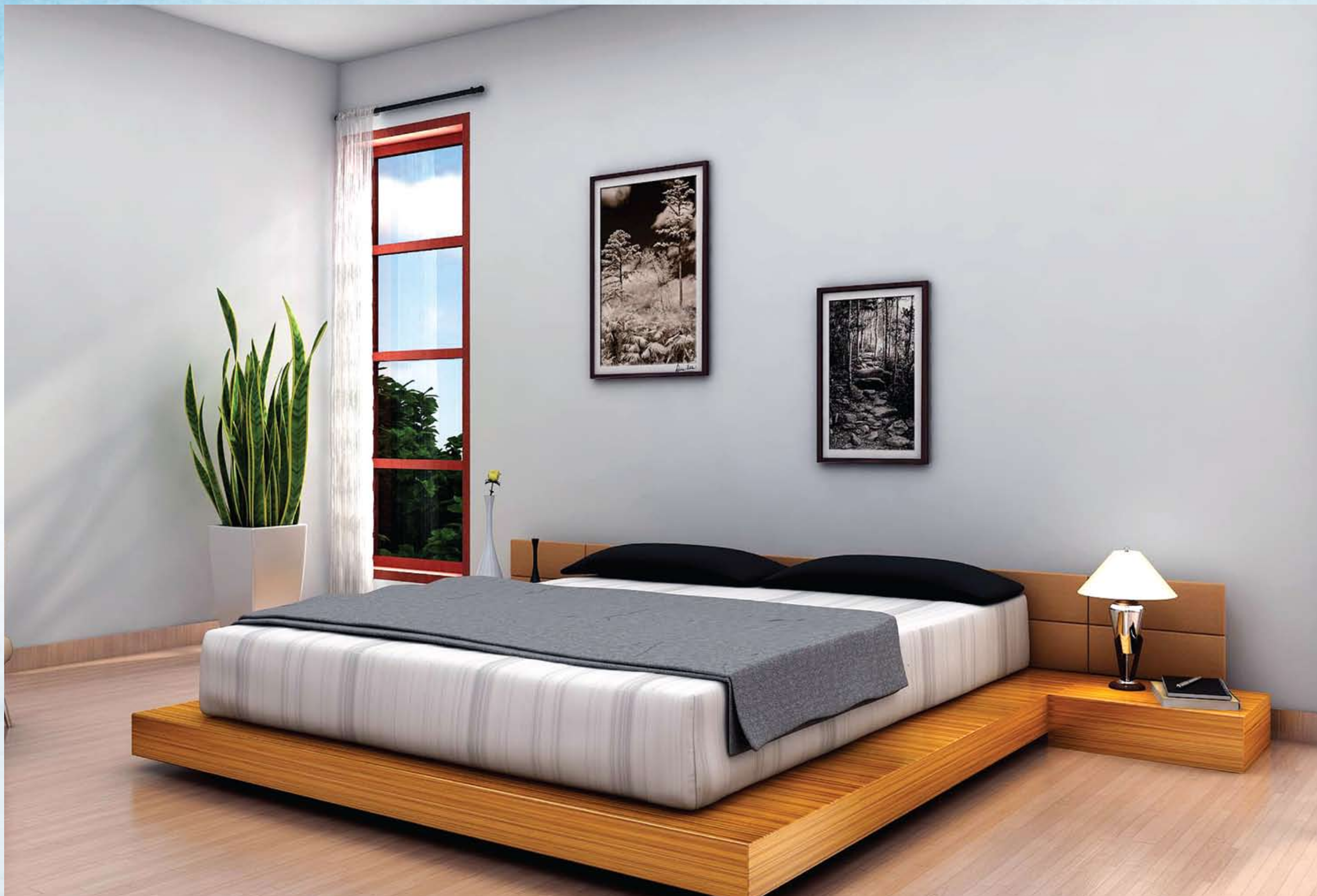
Four master bedrooms, each with a walk-in wardrobe, make the regal experience complete.